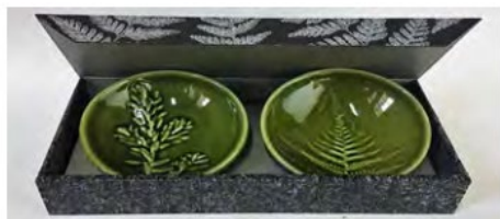
C0987D Totara and Silver Fern

ALL PRICES ARE IN NZ$ AND EXCLUDE GST AND FREIGHT