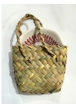
CE0551 same as CE0497 above