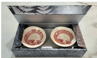
CE0552 same as CE0499 above

"Certified food safe, dishwasher and microwave safe."