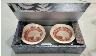
CE0297 same as CE0499 above

ALL PRICES ARE IN NZ$ AND EXCLUDE GST AND FREIGHT