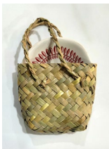
CE0298 same as CE0497 above