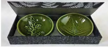
C0987D Totara and Silver Fern

ALL PRICES ARE IN NZ$ AND EXCLUDE GST AND FREIGHT